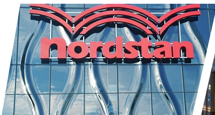
"NORDSTAN" Göteborg, Sweden Fasadglas Bäcklin AB