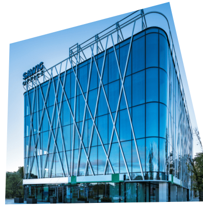
Sawig office, Krakow, Poland INDO Architects