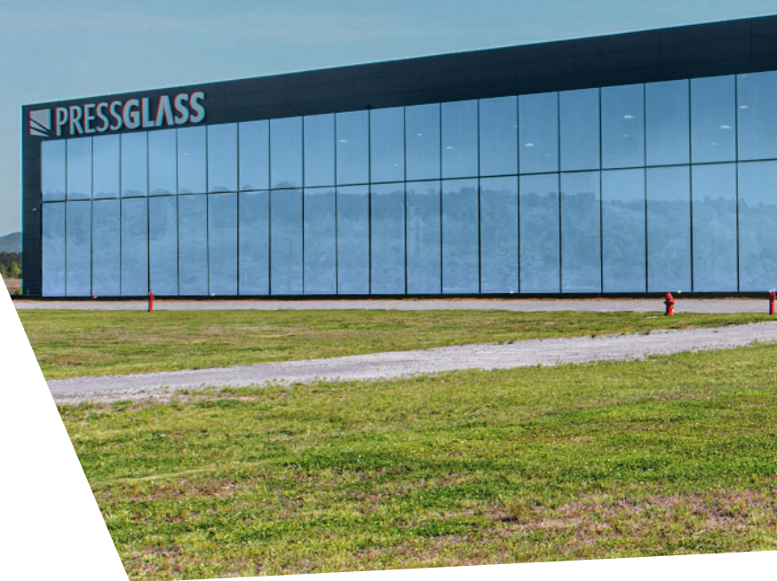
Press Glass Plant, Ridgeway, VA