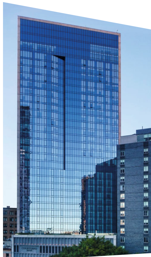
(LIC Mariott) 29-07 Queens Plaza North, NYC, NY Handel Architects LLP