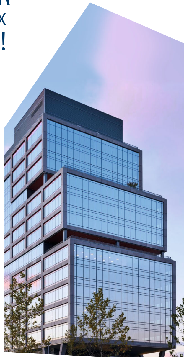
Dock 72, NYC, NY S9 Architecture